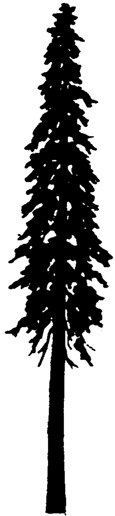
Abies amabilis - Pacific silver fir