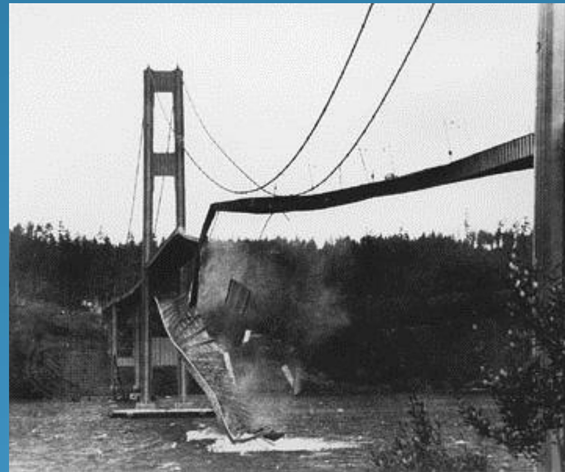
Tacoma Narrows Bridge collapse [8]

Aeroelasticity applies to any situation in which a fluid (gas or liquid) flows around a structure [3].