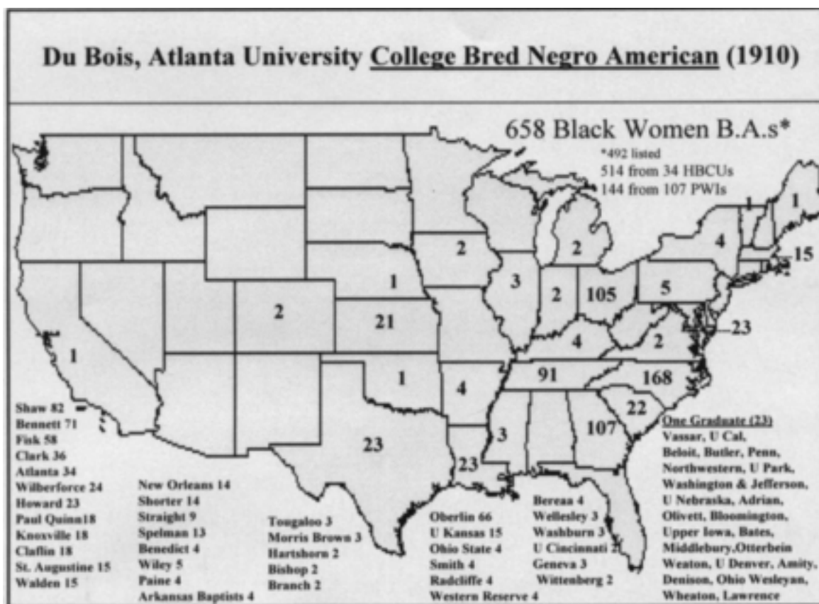
Figure 2: Du Bois and Dill's Calculation for Black Women's Degree Attainment (1910). Map by Stephanie Y. Evans.

Unlike in the antebellum years, when northern schools had significant attendance by Black women, by the 1900s, the leading schools for Black collegiate women were in the segregated South. The "Seven Sisters" women's colleges were surprisingly slow to grant access to Black women, and there were only three historically Black women's colleges: Spelman in Georgia, Bennett in North Carolina, and Hartshorn Memorial in Virginia. 5